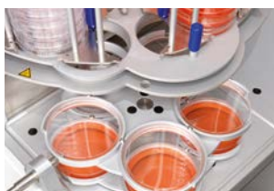
Systec Mediafill with Petri dishes