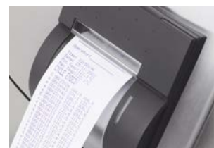
Systec Mediaprep printer for documentation