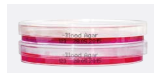
labelling on the sides of Petri dishes