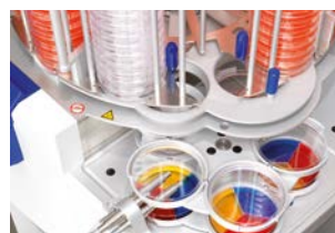
Systec Mediafill with Tri-Plates