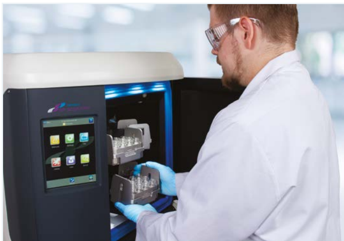
SP Genevac HT S3i Evaporator

Probes are light sensitive and too much exposure to light could lead to degradation to produce false results. On the HT S3i the lamp positioning, coupled with the aluminium sample holders, will accelerate the drying process without compromising and damaging the probes by light.